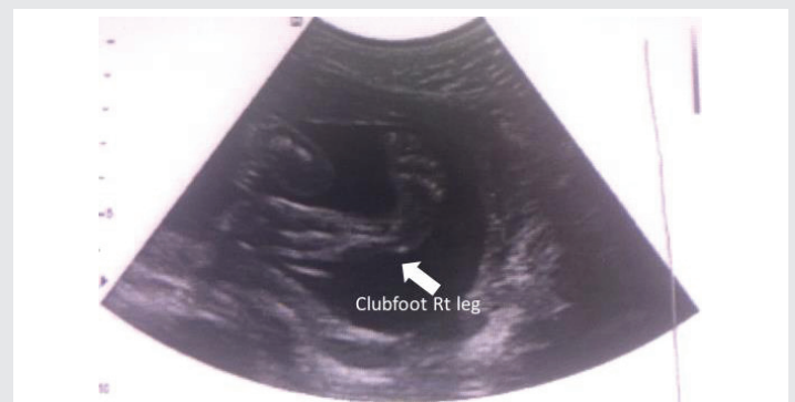
Figure 1: Ultrasound showing the right lower leg after amniotic band bind around (3D).

When her gestational age reached 24 weeks, the pregnancy examination showed that her uterine size was correlated with gestational age. According to the ultrasound examination result, there was a large amniotic band located at the amnion