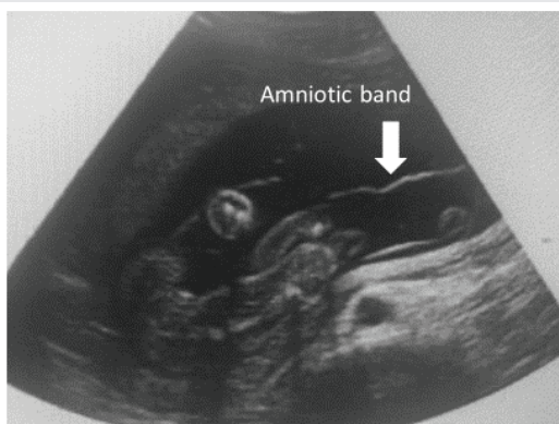
Figure 3: Ultrasound showing the presence of Amniotic Band in amniotic fluid (3D).