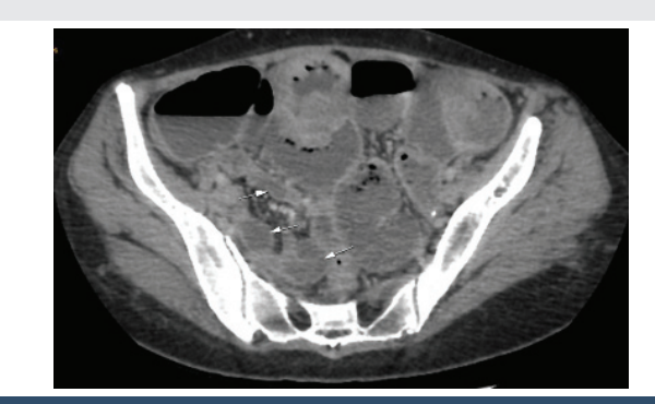
Figure 1: CT scan showing wall thickening of the ileal loops with upstream stasis.

The pathogenesis of eosinophilic gastrointestinal disorders is not well understood. They probably result from a complex interaction between environment, genetics and immunological factors [5]. Several epidemiological studies suggest an allergic component, in particular food allergies, which elicits a Th2type immune response leading to the production of cytokines, such as interleukins, IL-4, IL-5, IL-13 and eotaxins-3. This results in intestinal eosinophilia, which further causes local inflammation by releasing toxic cationic proteins [6]. Even less is known about the etiology of primary eosinophilic colitis. It is associated with food allergies and atopy in several cases described [1]. It can probably be both an IgE and non-IgE mediated disease [7].