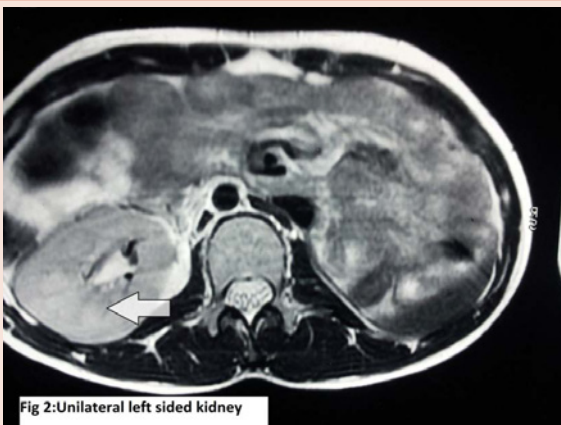
Fig 2: Unilateral left sided kidney