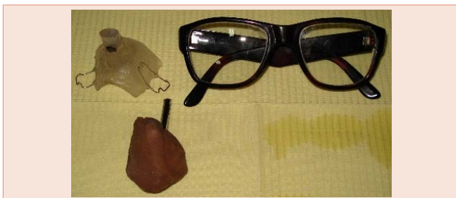
Figure 6: Nasal prosthesis, Palatal prosthesis and Glasses.

was fabricated and delivered to the patients within a week to achieve the objectives outlined.