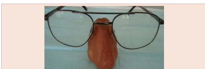
Figure 3: Nasal prosthesis with eye glasses.