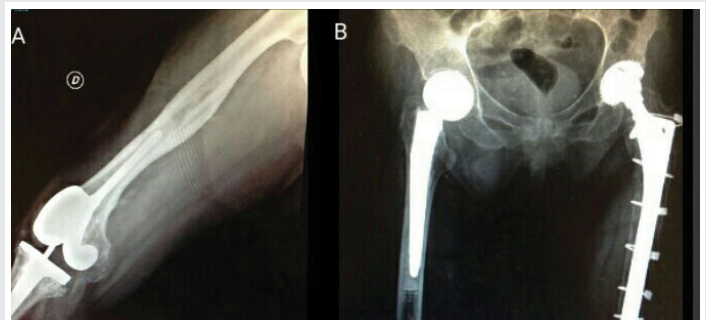
Figure 1: (A) Right lateral knee radiograph in a patient with PTR. (B) Anteroposterior radiograph of the pelvis and proximal femur. It is observed in primary PTC right hip and PTC left hip revision with cerclages.

Therefore, we believe that the personal history of a hip or knee prosthesis is an important detail when planning a lower limb amputation, requiring a thorough radiological control (preoperative and intraoperative measurements) and adequate staff and Instruments. In the case of TKA, fewer doubts arise because a more proximal amputation can be performed if necessary. The problem lies in patients with THA, in which, if the appropriate section height is not calibrated, we can find the disadvantage of the femoral stem. Requiring a second intervention and special instruments with the consequent risks and costs entailed.