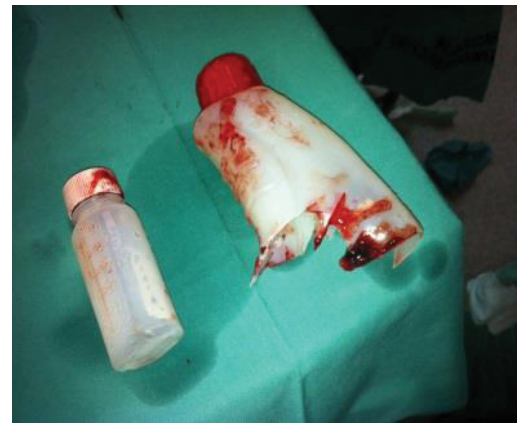
Figure 4: Completely removed foreign body.