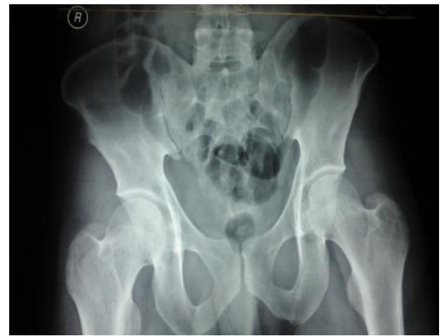
Figure 5: Pelvic x-ray of patient.