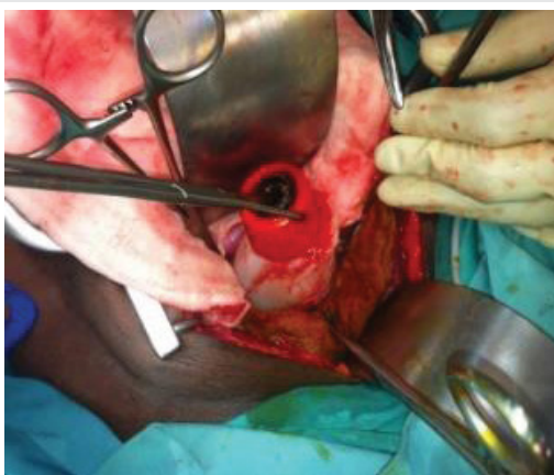
Figure 3: Removing the foreign body.