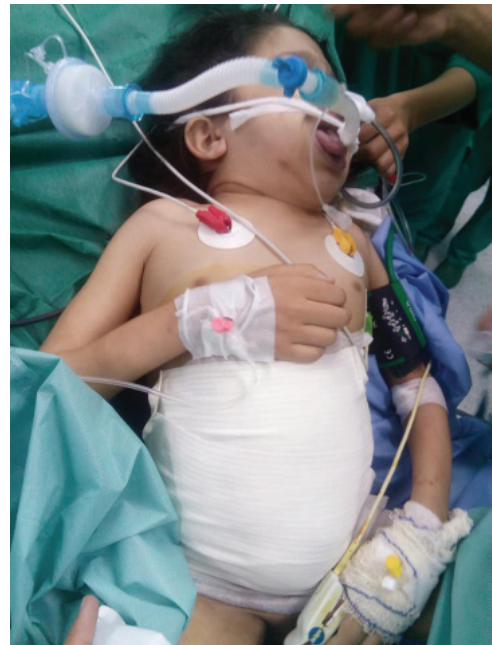
Figure 4: Picture immediately after the surgical operation.