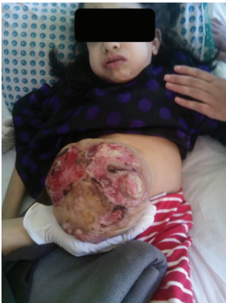
Figure 1: Giant umbilical hernia around with ischemic skin changes in a patient with Hurler's syndrome.

the degradation of GAGs, causing accumulation of partially degraded products. MPS is estimated to affect one in every 20,000 live births [3,4]. The observation we report proves that the umbilical hernia accompanying Hurler's syndrome can reach an impressive size with a risk of complication, which leads us to reconsider the abstentionist attitude in some cases. The arguments that have motivated surgical treatment are mainly represented by the volume of the hernia, the risk of strangulation and the significant functional impairment [5]. Surgical treatment can be a laborious process. Airway management can be difficult due to macroglossia and short neck with limited mobility [6]. The trachea may be narrow, the soft tissues are swollen and bleed easily, and these patients are susceptible to bronchospasm. Spinal anesthesia is contraindicated because of the associated spinal malformations. Laryngoscopy and fiber-optic bronchoscopy may be used for intubation. In difficult cases, the laryngeal mask has been shown to be a useful additional aid [7]. Yeung