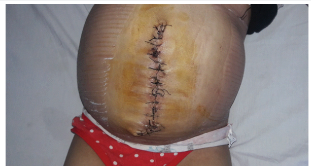
Figure 4: Picture immediately after the surgical operation.

et al. (2009) used flexible fiberoptic laryngoscopy (FFL) and polysomnography (PSG) to assess some patients with different types of MPS. They found that 19 of their 27 patients presented with upper airway obstruction. Of these 19 patients, seven were submitted to PSG and had an AHI between 10 and 17. Only five of the patients were submitted to direct laryngoscopy, which revealed the presence of macroglossia and of redundant tissues