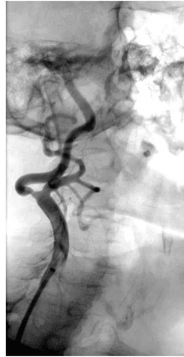
Figure 2: Internal carotid stenosis before carotid artery stenting procedure.

The type of stent used, as well as its length, may have been the reason for this condition. Both open- and closed-cell stents are available. Each of these types has different properties. No correlation has been shown between the type of stent design and the incidence of acute stent thrombosis. However, it has been noted that open-cell stents are more flexible and adapt more easily to the shape of tortuous vessels. In case of a tortuous vessel, the use of a closed-cell stent may increase the risk of vessel kinking distal to the stenosis, which directly leads to thrombus formation inside the stent [4]. In the above